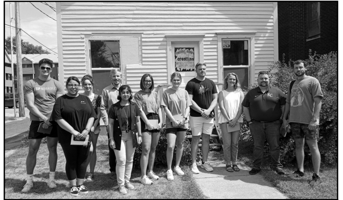
UNL student architects met at the Art Chapel on Wednesday, August 24